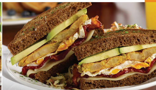
Southern Slammer Sandwich Best Breakfast Sandwich in America, Restaurant Hopsitality