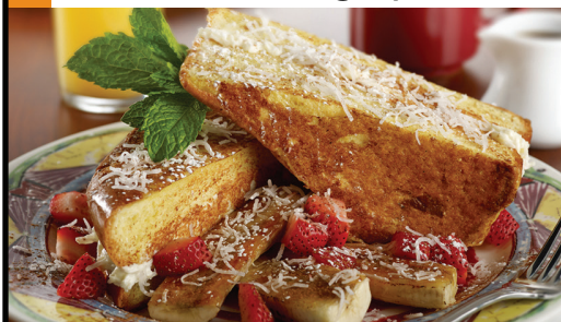
Coconut Cream Stuffed French Toast As seen on Food Network's Diners, Drive-Ins & Dives

Thanks to Sacred Heart Parish for providing a pick-up space. A $5.00 charge per order will be added & donated in full back to Sacred Heart.