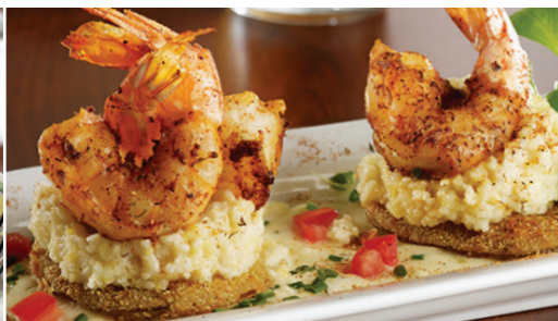
Get Your Grits On As seen on Food Network's Diners, Drive-Ins & Dives